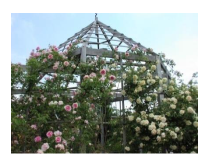
Photo: A pergola at La Roseraie du Désert showing off Rosa 'Marie Robert' and Rosa 'Parks Yellow Tea'

There are some additions to our 'Recommendations' lists: designers (Jean Mus & Companie and Jardinerie Nova) and pépinièristes (Pépinières Pellizzaro and La Roseraie du Désert).