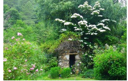
Photo: Cornus kousa growing around a small pigeonier