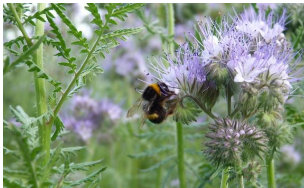
Green manure in the vegetable garden. Phacelia tanacetifolia