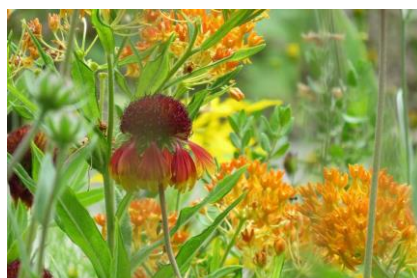
La Campagne Sainte-Marie