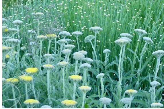
Medium height ground covering plants. Achillea coarctata , Santolina neapolitana