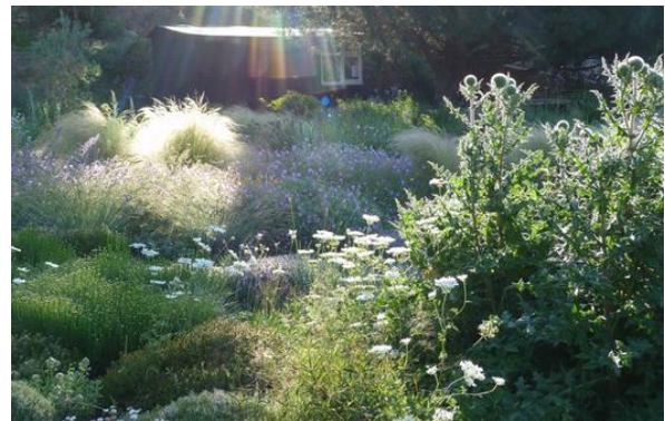
L to R: Lavandula 'Alba' , L. 'Grosso' , Festuca glauca , Santolina viridis , Geranium 'Rambling Robin' , Pennisetum 'Red Buttons' , Cistus florentinus , Orlaya grandiflora , Nassella tenuissima , Echinops tienschanicum