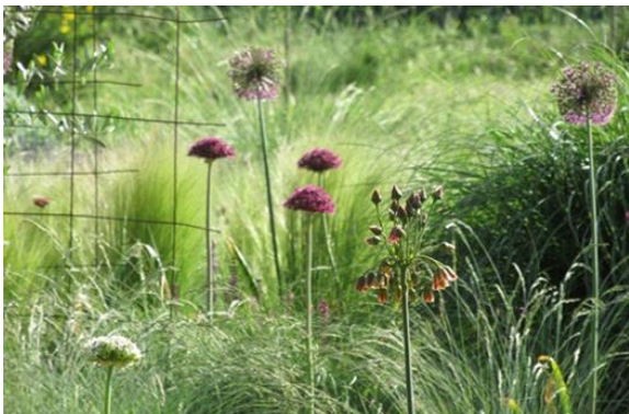
Spring flowering bulbs: L to R: Allium nigrum , A. atropurpureum , A. 'Purple Sensation' , Nectaroscordum siculum