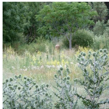
Jardin champêtre (Caunes-Minervois, 11160)