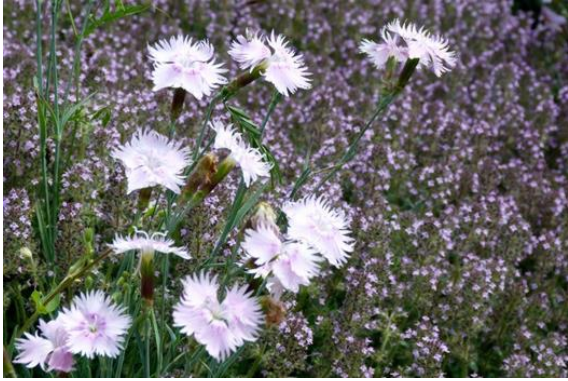
Low growing ground-covering plants. Dianthus anatolicus , Thymus polytrichus

“In flower in May are ground covering plants, green manure, alliums, and a good mix of Mediterranean shrubs, grasses and perennials. These plants have been chosen to create a romantic garden that teems with wildlife and only needs supplementary watering during exceptionally hot weather.”