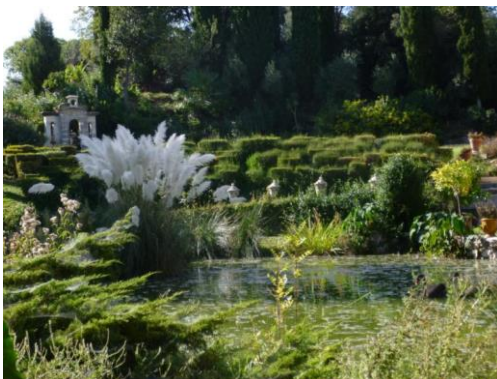
Jardin du Fond de Bézombes (34)

This season in Occitanie we have 10 gardens due to open at various times during the spring/summer season and autumn. Do go to the web site to find out opening times, and of course, to find out more about beautiful gardens in other areas of France that are opening this season.”