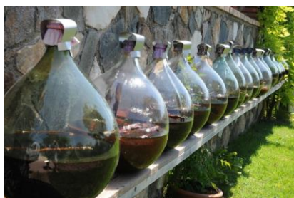
La Vinaigrerie de Callas