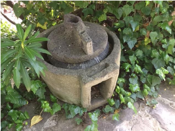
Photo: Ancient flour mill.