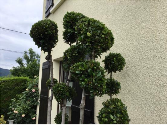
Laurus nobilis pruned into a cloud formation after two years.