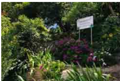
Photo: The experimental garden