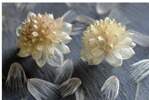
Photo: Myrsine africana