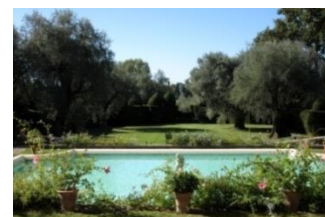
Photo: The view from the house at L'Hermitage