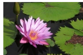
Photo: Nymphaea 'King of Siam'