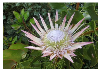
Photo: Protea cynaroides , the king protea

Cape Town, the winelands, botanical walks and visits to 22 gardens!