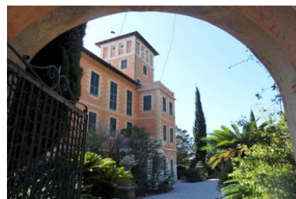
Photo: The Palazzo Orengo, Giardini Botanici Hanbury