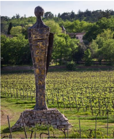
Jean-Jacques Tosello : Templier

Visit to Commanderie de Peyrassol , 83340 Flassans-sur-Issole.