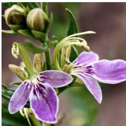
Teucrium bicolor Local name, Oreganillo

Three new entries have been added to the ' Plant of the Month ' section. All are endemic to Chile. Read about: