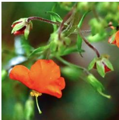
Alonsoa meridionalis Local name Ajcillo