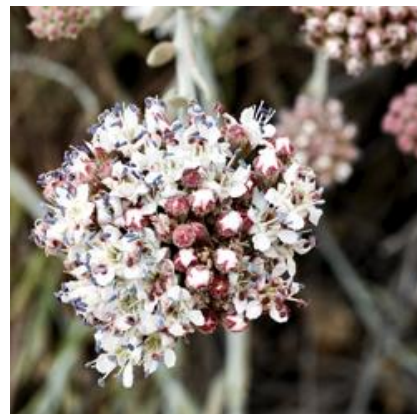
Malesherbia fasciculata Local name Hierba Miel

Noting that there is a nursery in France which specialises in plants from Chile: