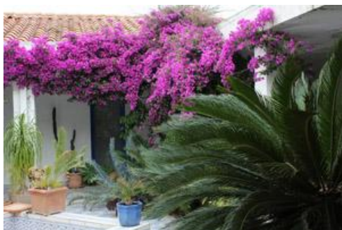
Patio in June