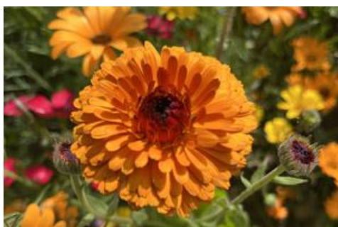
Photo: Calendula officinalis